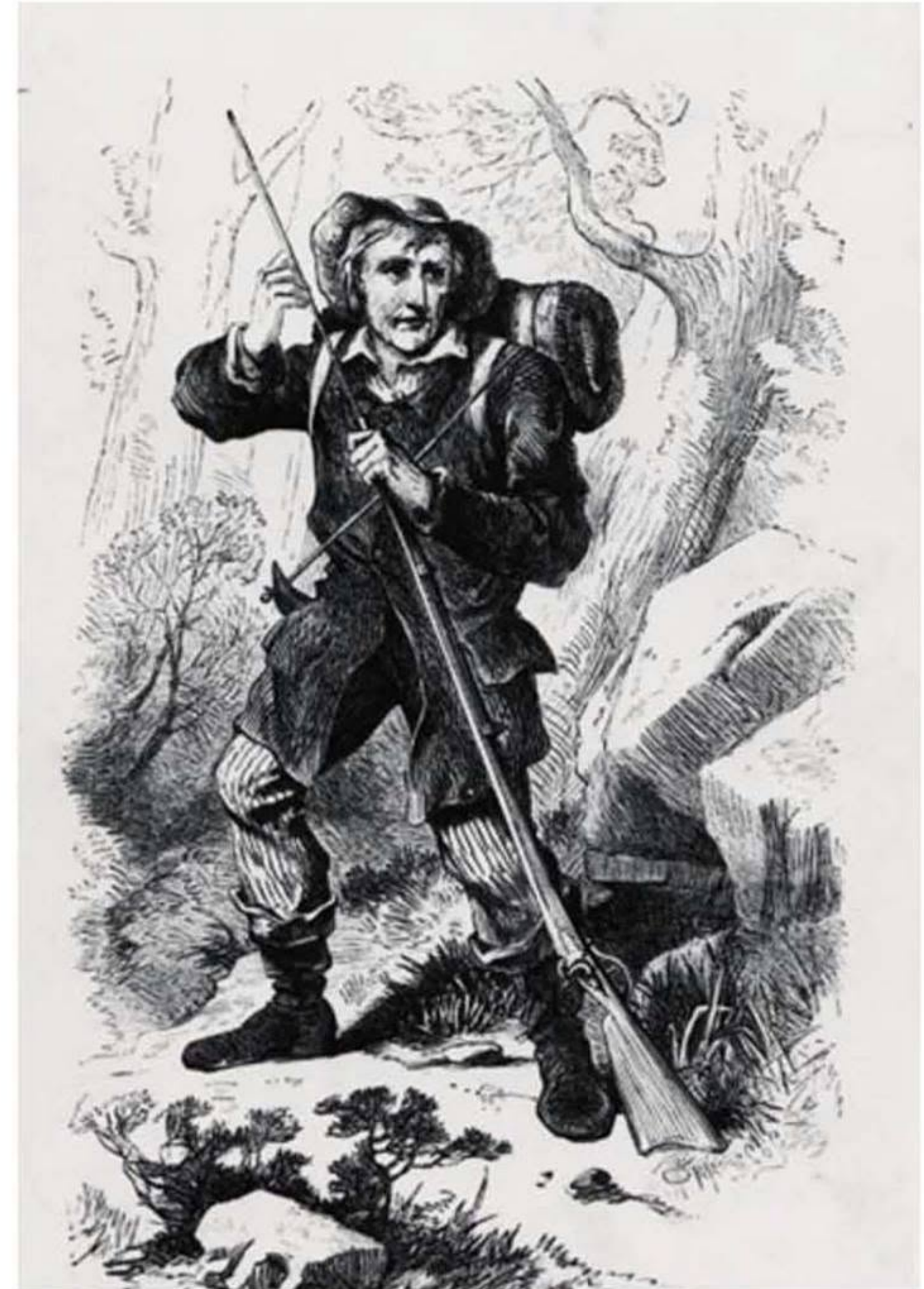
Drawing of a squirrel hunter (AL06216)

As the Confederate invasion into Kentucky unfolded, a handful of Union soldiers under Major General William "Bull" Nelson were defeated at Lexington, Kentucky. Nelson's Union forces represented the last true semblance of Northern might between the Confederate forces and Ohio. The Union high command, along with federal and